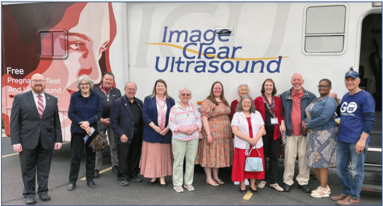
Image Clear Ultrasound Mobile Unit Visit a Success