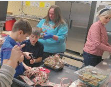
"Busy in the Kitchen"