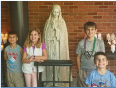
The Koziol Children