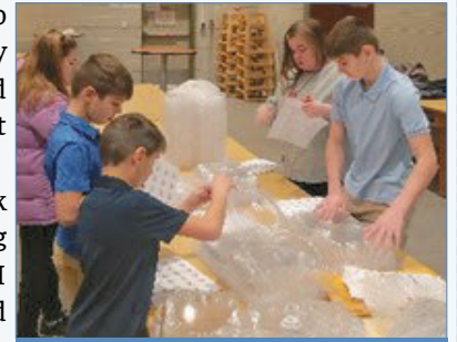
"Preparing for the Annual Christmas Cookie Walk"