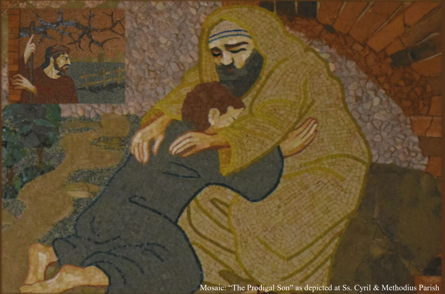
Mosaic: "The Prodigal Son" as depicted at Ss. Cyril & Methodius Parish

A Personal Parish Established To Serve The Slovak Catholic Community In The Archdiocese Of Detroit