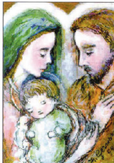
Bundle of Joy, Fr. G. Pegoraro, S.C. © 1999 Pious Union of St. Joseph, Inc.

Please spiritually adopt an unborn baby. Every day over 4,000 babies are killed by abortion. They have so little protection only the hand of God can end this massacre. Prayer is the best weapon to help them - the most effective.