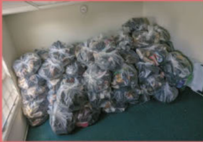
This is the BIG pile. There are 98 bags of shoes here!

➤ Because of you and your generosity we collected OVER 2,400 pairs of shoes! ➤