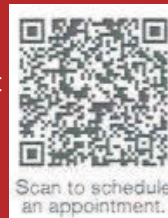
Scan to schedule an appointment.