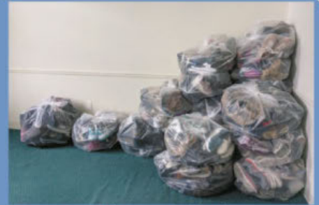
Our first "big pile". There are about 15 bags of shoes here.