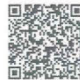
Scan to schedule an appointment.

Our next American Red Cross Blood Drive takes place on Tuesday, September 26, from 11:00AM—5:00PM. If you donated blood at our last Blood Drive in July, you are eligible to donate at this drive. Thank you for your compassion to help those who are in need of this life-saving act.