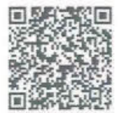
Scan to schedule an appointment.

To schedule an appointment, please scan the QR code to the right or go to RedCrossBlood.org and enter sponsor code: stcyril or call 1-800-RED CROSS (1-800-733-2767).