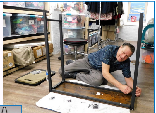
Above: Volunteers & Gianna House Staff celebrate reopening on March 16, 2024.

See Article on Page 6 for more information about Gianna House