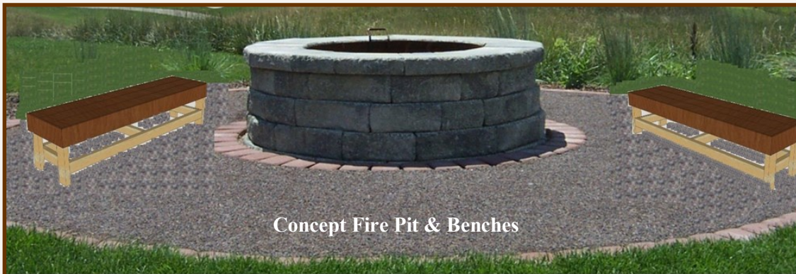
Concept Fire Pit & Benches