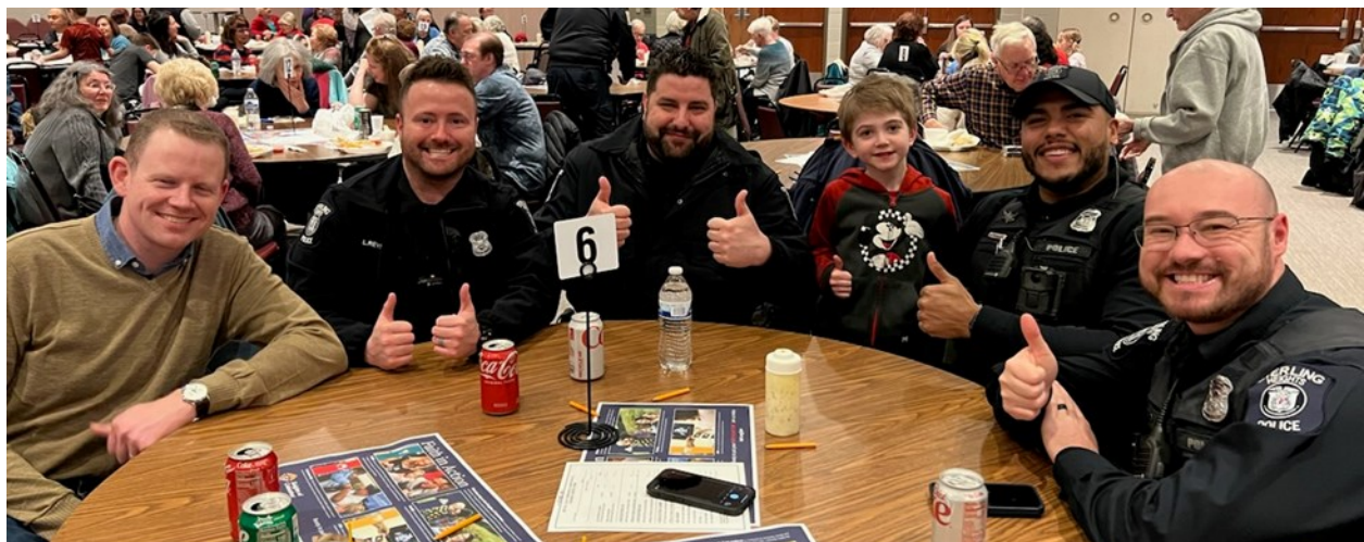
Sterling Heights’ ‘Finest’ came out to try our Fish

As always, if any Catholic gentleman over 18 is interested in becoming a Knight of Columbus, please contact the office here at Church or talk with any Knight. We can quickly and easily qualify you and welcome you into the Order.