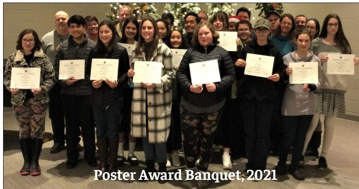
Poster Award Banquet, 2021