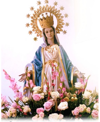
If great sign appeared in the sky, a woman elothed with the sun, with the moon under her feet, and on her head a crown of twelve stars. Rodution 12:1

Novena Mass Cards are now available: in the Parish Office on weekdays and after Holy Masses on weekends or you may order them online at: www.saintcyrils.church If you order online, you may have your cards: † mailed to your loved ones for you † pay through PushPay The Holy Sacrifice of the Mass Is the most precious gift anyone can receive.