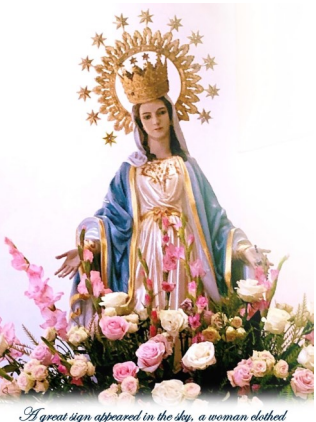
A great sign appeared in the sky, a woman elothed with the sun, with the moon under her feet,

The Holy Sacrifice of the Mass Is the most precious gift anyone can receive.