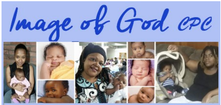
Image of God Catholic Pregnancy Center in Madison Heights is looking to train new volunteers to help with counseling and simple tasks in the boutique, office and classroom. Pro-life Ultrasound Technicians are also desperately needed and are paid top rate. Put your pro-life faith into action.

Sign the petition to Congress at: NoTaxpayerAbortion.com