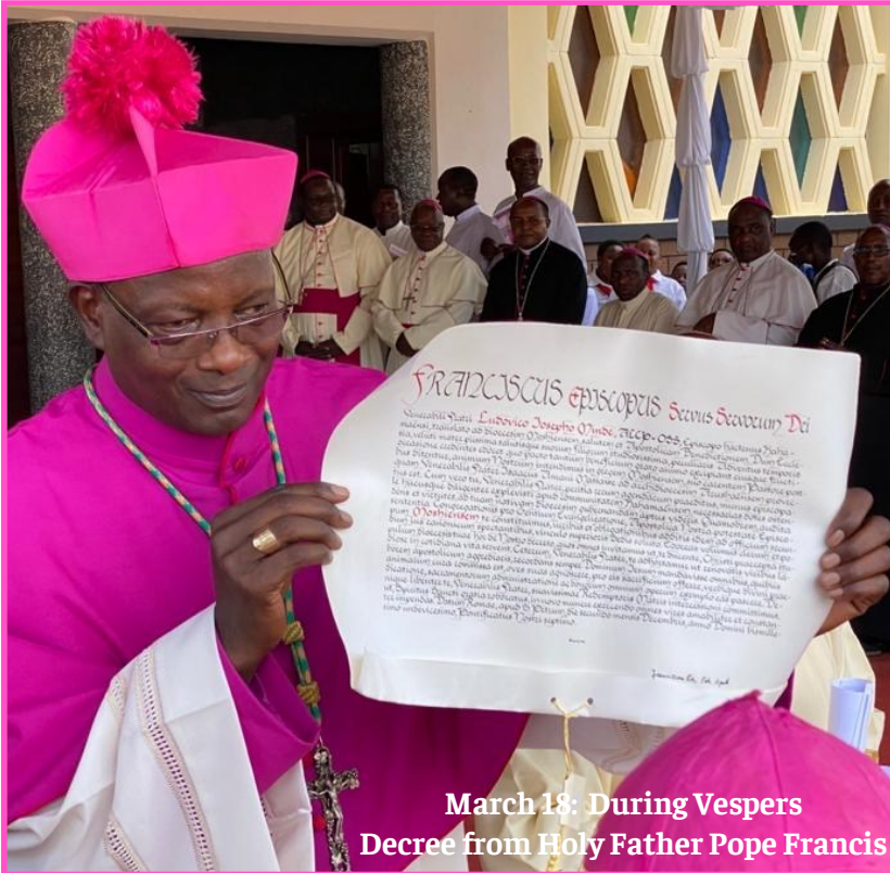
March 18: During Vespers Decree from Holy Father Pope Francis