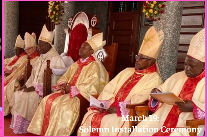
March 19: Solemn Installation Ceremony