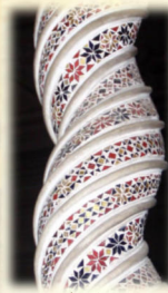
12th Century Easter Candle Stand